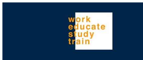
Work Educate Study Train (Portugal)